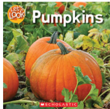
Pumpkins by Chelsea Donaldson