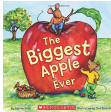
The Biggest Apple Ever by Steven Kroll