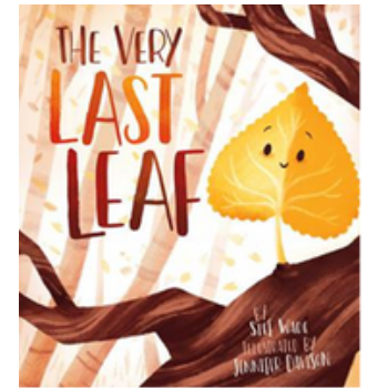
The Very Last Leaf by Stef Wade